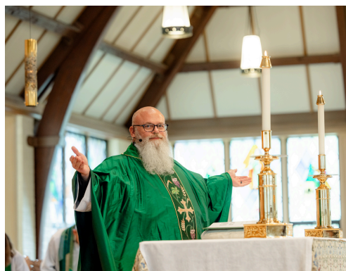
Worship & Liturgy