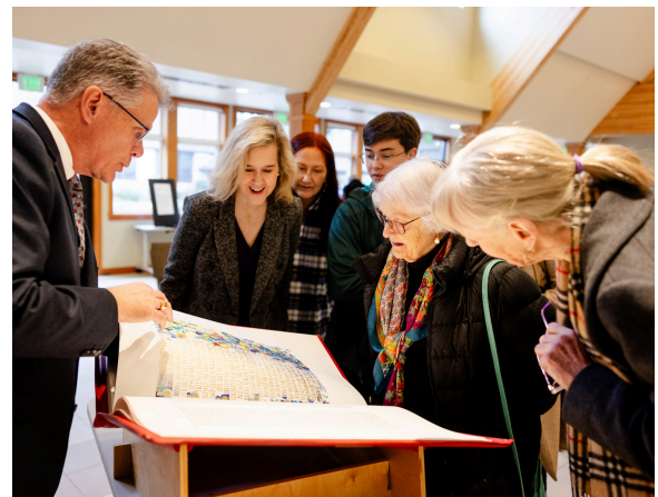
St. John's Bible