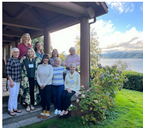
Men's and Women's Retreats