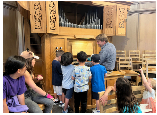
Children & Youth