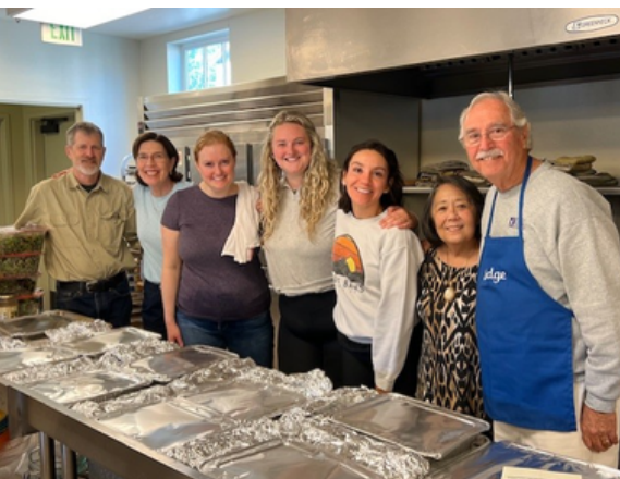
Cooking for Neighbors in Need