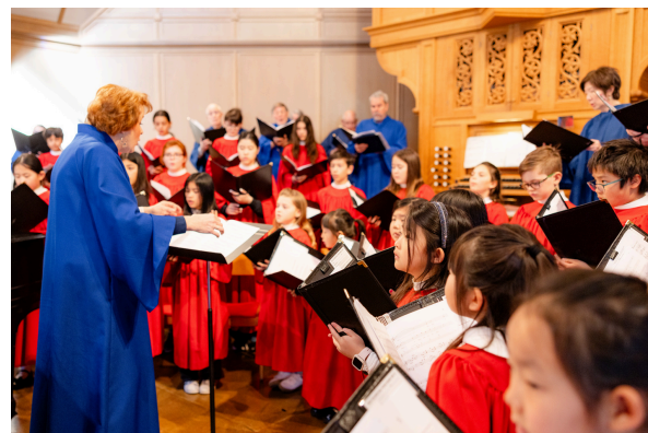
Music: St. Thomas Choir & Choristers