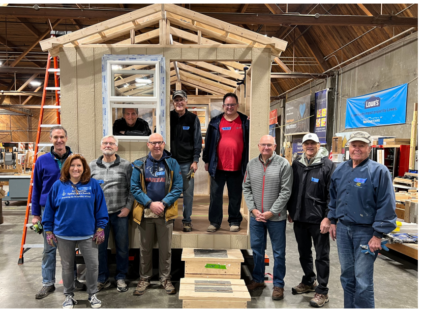
St. Thomas Members constructing a Tiny Home at Sound Foundations of Seattle this week.

November 24, 2024 | The Feast of Christ the King