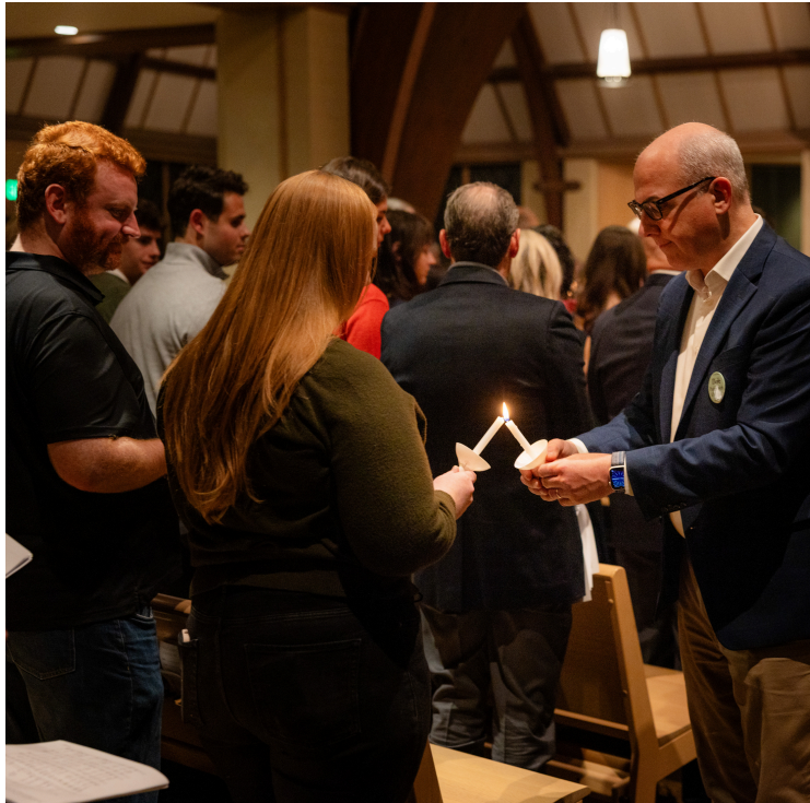
Sharing the light.

At St. Thomas Church, we strive to be a community where the dignity of every human being is seen and honored. As Christians we seek to welcome all of God's people, celebrating the fulness of their being that is inclusive of race, ethnicity, sexual orientation, education, faith history, age, economic status, sex, gender identity and expression, language, physical and cognitive ability. We seek to be the Body of Christ where all members feel safe, loved and that they belong. Whoever you are, and wherever you are on your spiritual journey, there is a place for you at St. Thomas!